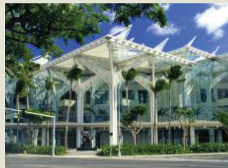
State of Hawaii Convention Center Oahu