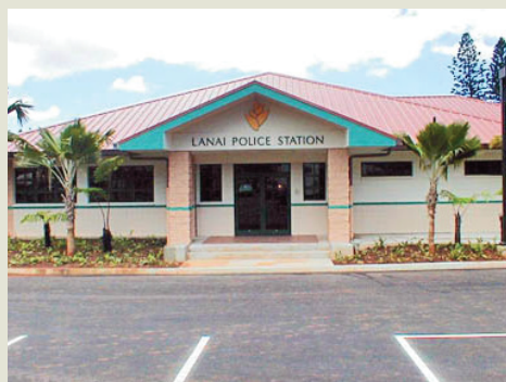
Lanai Police Station Lanai