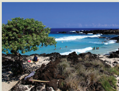
Kekaha Kai State Park Kauai