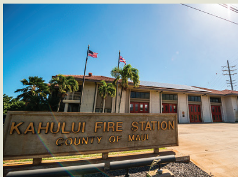
Kahului Fire Station Maui

Hawaiian Tax-Free Trust is a mutual fund which seeks to provide as high a level of current income, exempt from both State of Hawaii and federal income taxes, as is consistent with preservation of capital. 4 To achieve this objective, the Trust invests primarily in tax-free municipal obligations of Hawaii issuers; securities that finance schools, highways, hospitals, water and sewer facilities, and other projects in Hawaii, examples of which are pictured here. 5