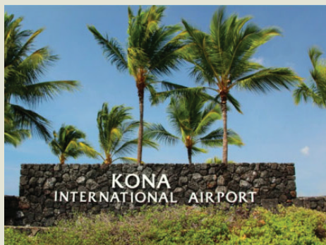
Kona International Airport Big Island of Hawaii